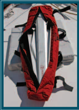
The FX-125 is very large but lightweight because it is made of high-tensile aluminum magnesium alloy.

The Navy testers noted that “high-strength steel” might be less “susceptible to permanent deformation under concentrated or unanticipated loading conditions,” but that Fortress compensated for the aluminum alloy it uses “through careful structural design.”