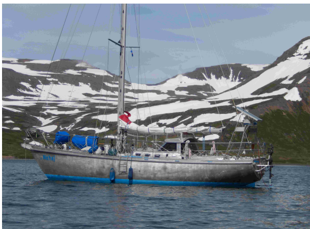
Nehaj in Iceland on her maiden voyage in 2015.