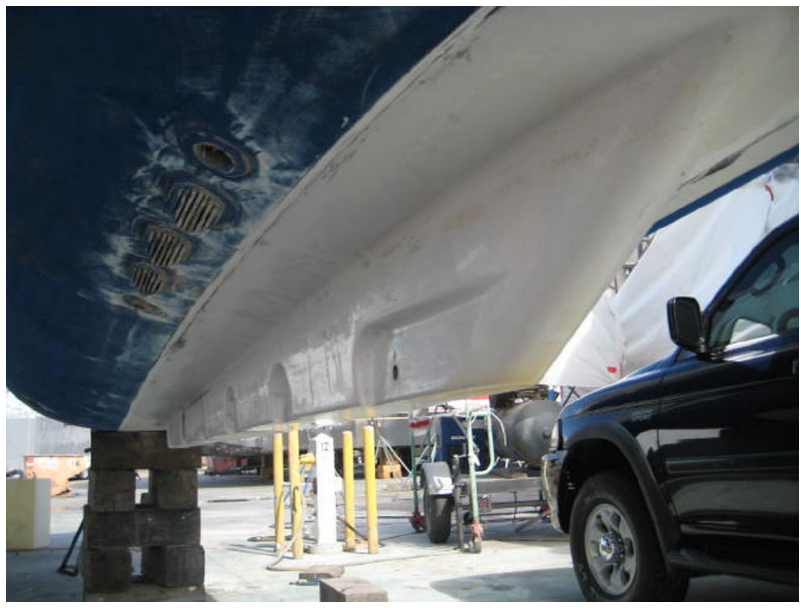
No damage to the male-female part and you can see the holes for the 6 thru bolts.