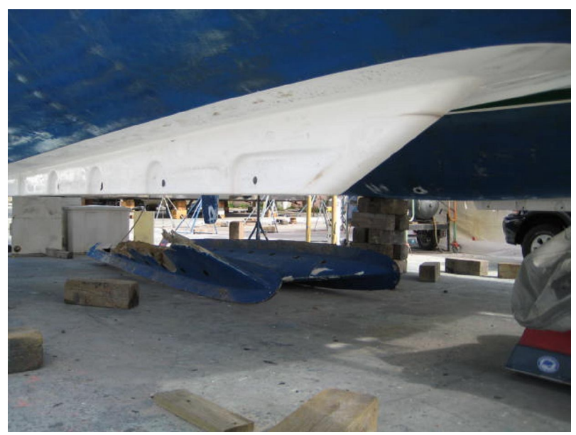
This is a picture of the hull after the 2 left-over's of the sacrificial keels were removed

These are pictures of a 2007 Leopard 46' that hit a reef on the south coast of Cuba. The sacrificial keels did the job they were supposed to do.