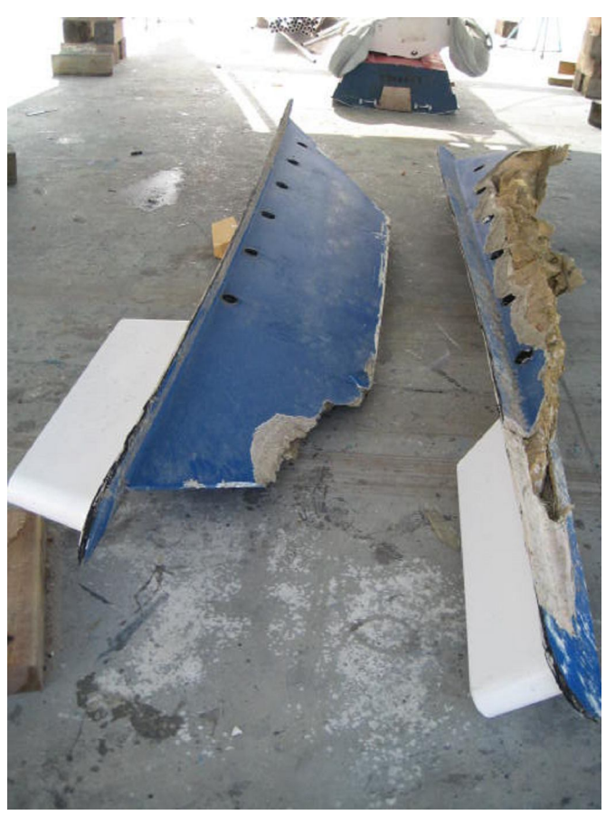
Shark attack or grounding?