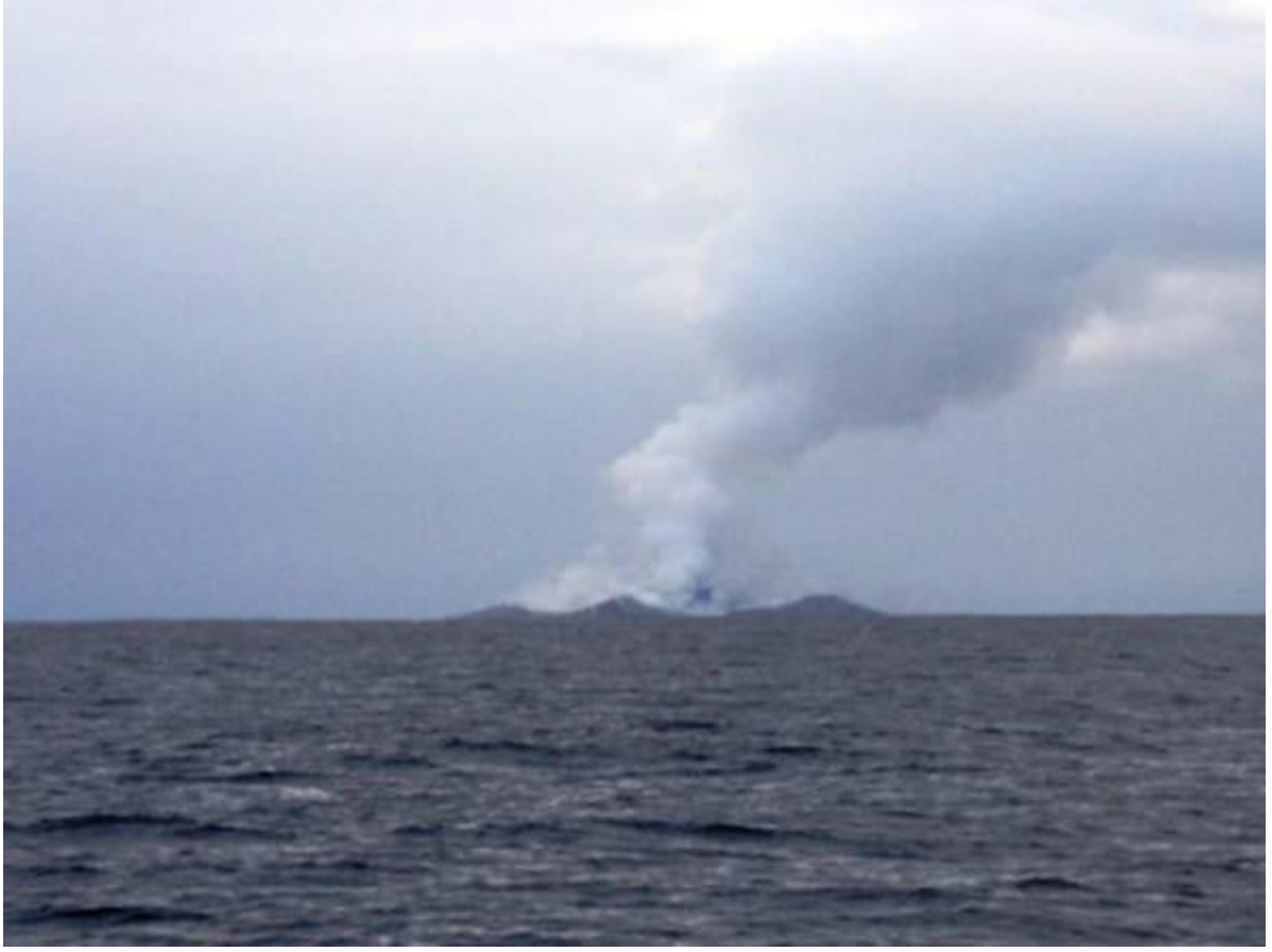
OUT OF THE OCEAN, MOUNTAIN PEAKS ARISE?