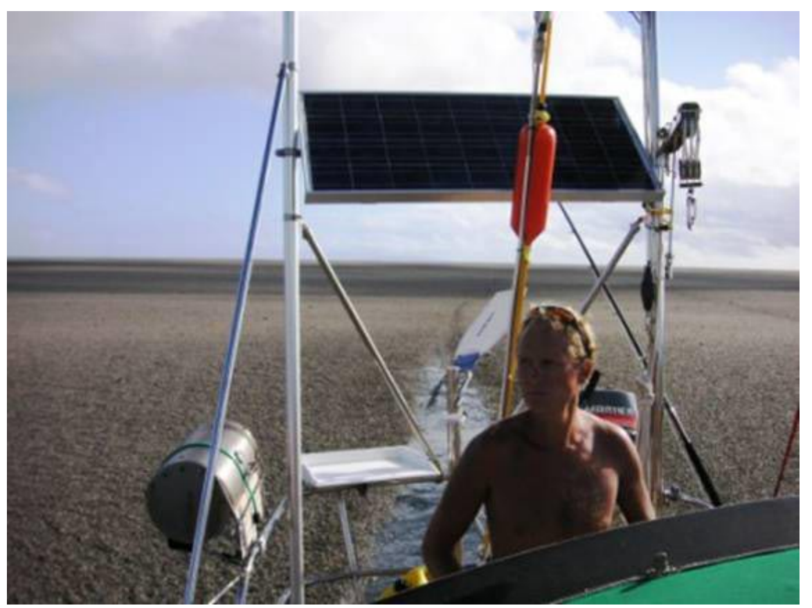
AN UNBELIEVABLE SIGHT, SO I HAD TO TAKE PICTURES BECAUSE NO ONE WOULD BELIEVE IT!