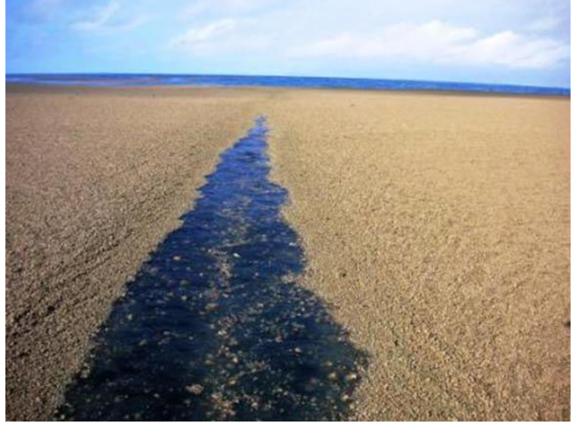
THE WAKE FROM MY YACHT.