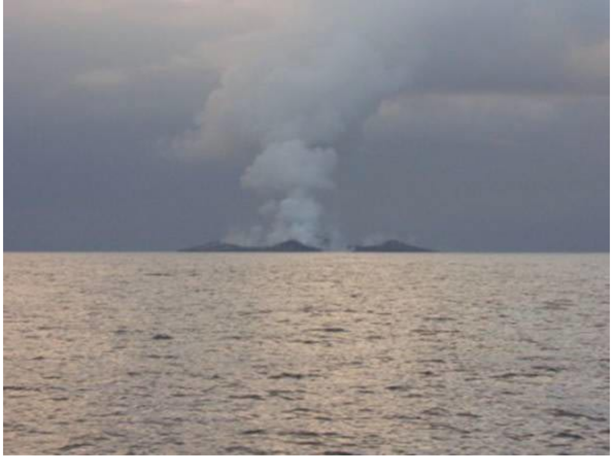
AND A BRAND-NEW ISLAND IS FORMED!