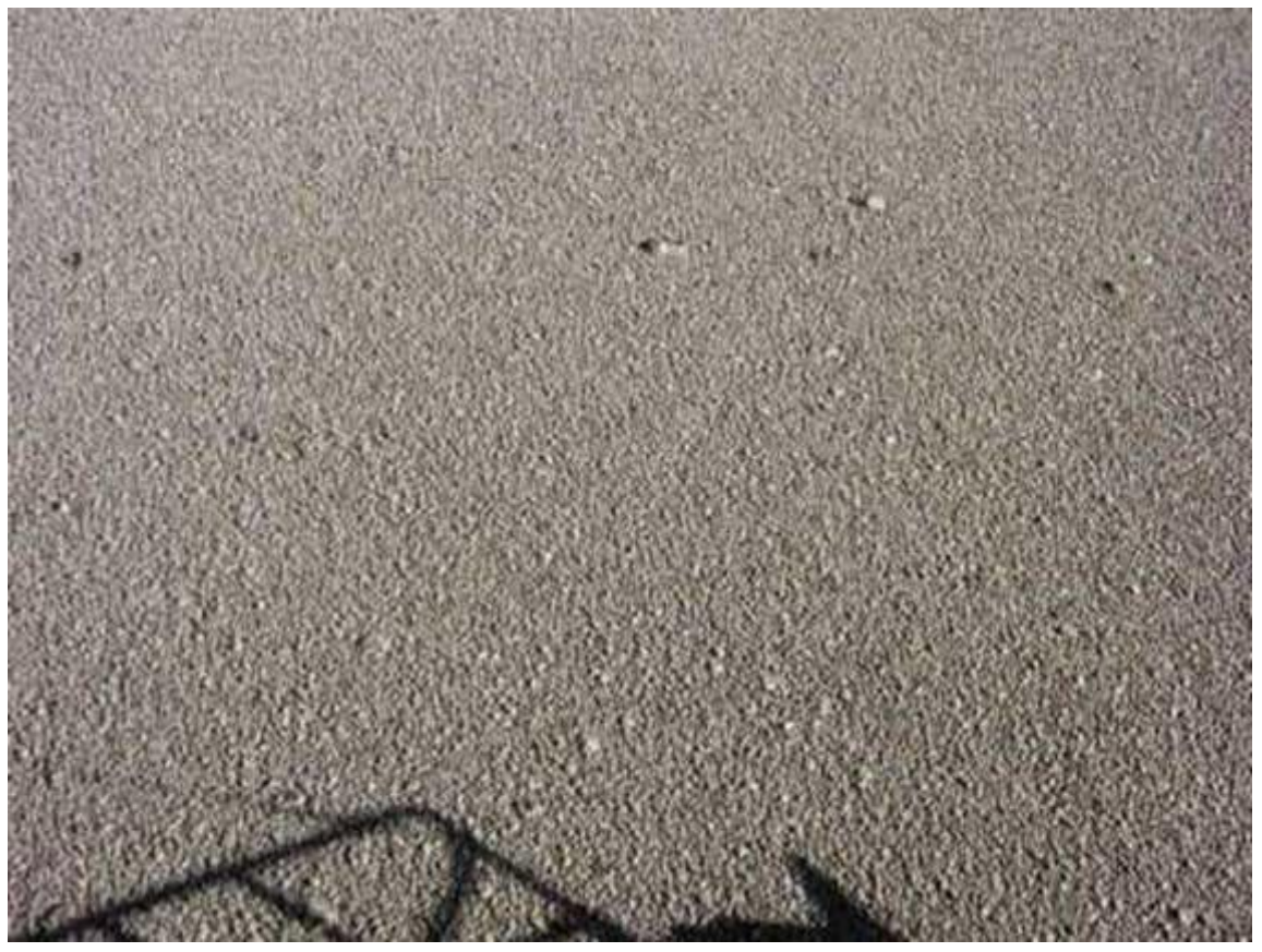
It's volcanic stones floating on the water.