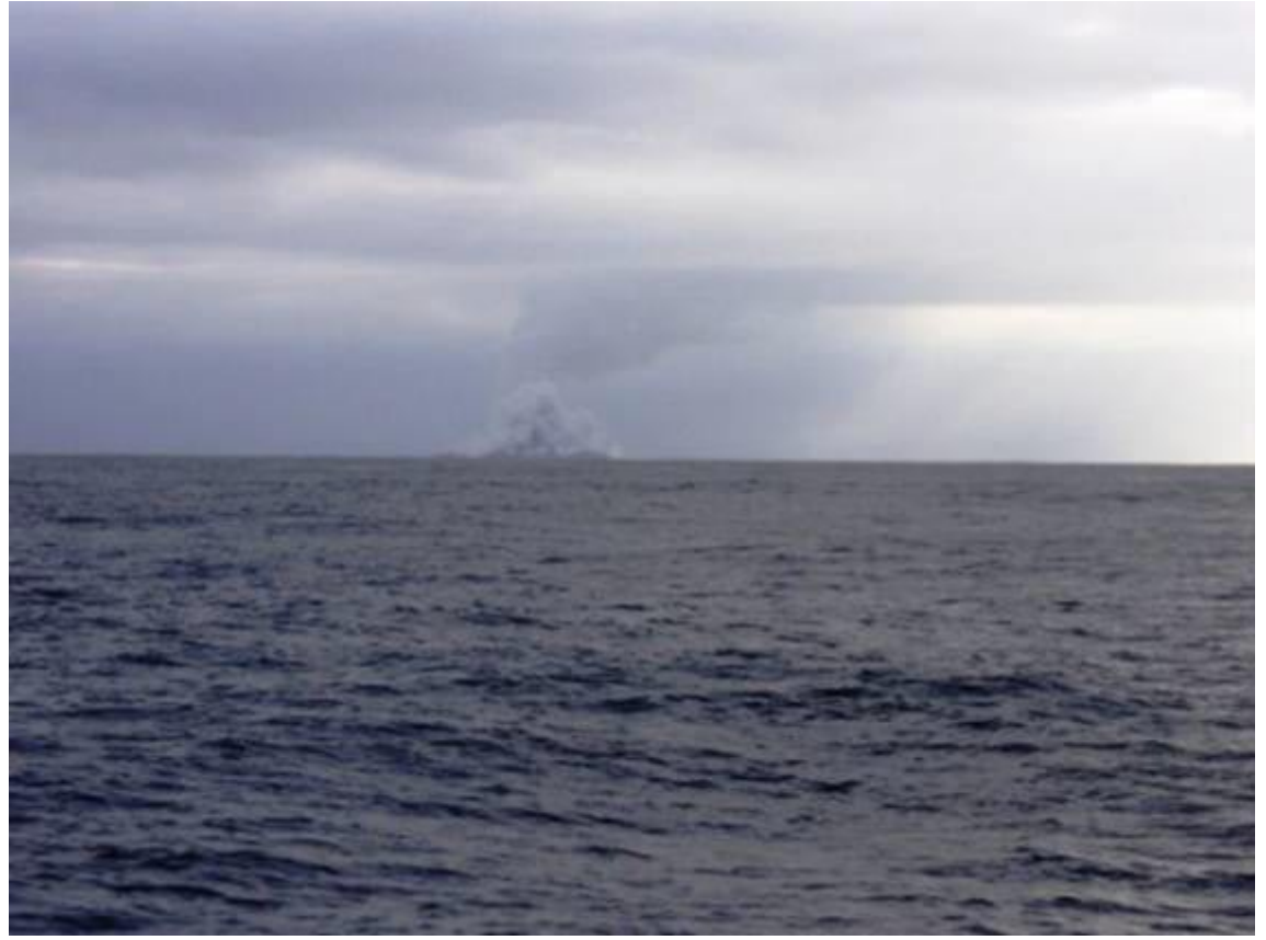
And, while WE were watching,